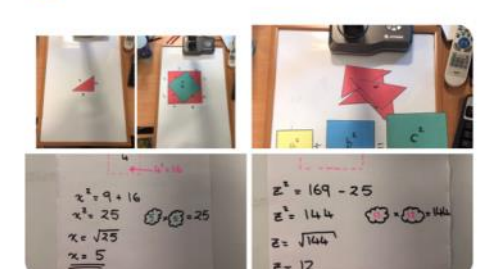
11:42 · 03/12/2020 · Twitter for iPad

Watched @misterwootube's video of how he taught Pythagoras, had to try it myself and it actually got kids to shout out the theorem for me! Loved it, took the chance to try a more pictorial approach to solving missing lengths in right angled triangles